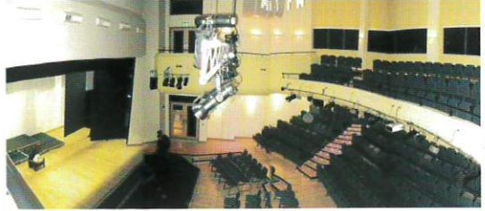
Examples of similar performance spaces