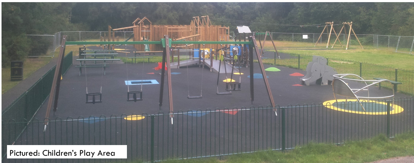
Pictured: Children's Play Area

The new playground at Calthorpe park pictured consists of 4 play zones, interlinking paths, safety surfaces, accessible equipment and disabled access.