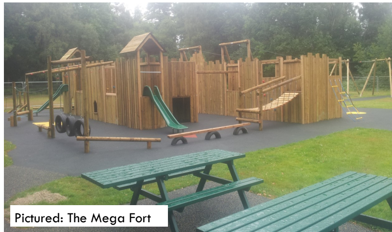
Pictured: The Mega Fort

The play equipment and activities are suitable for all age ranges and abilities from toddlers to teenagers and include at least two pieces of