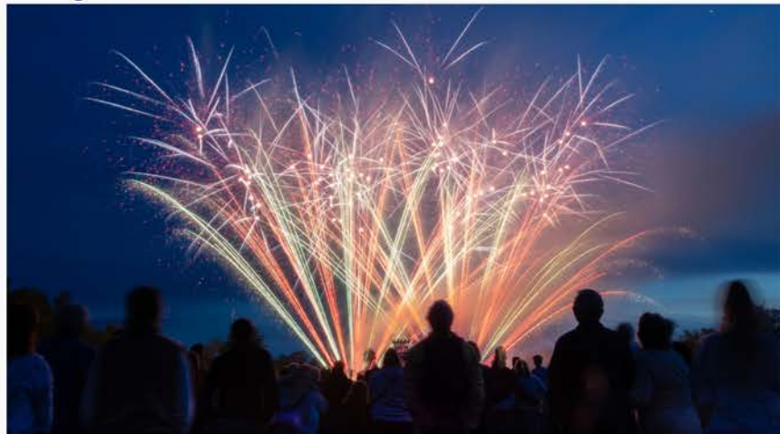
-To view all photos submitted, please visit Fleet Town Council's Facebook and Instagram pages

'The success of these displays depends on the active participation of a number of local organisations and businesses, raising funds for local charitable causes'